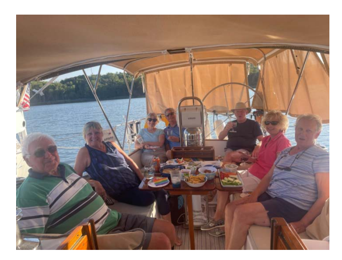
Friday, September 16: (11-37 nm) A misty 56 degrees greeted the fleet at sunrise.